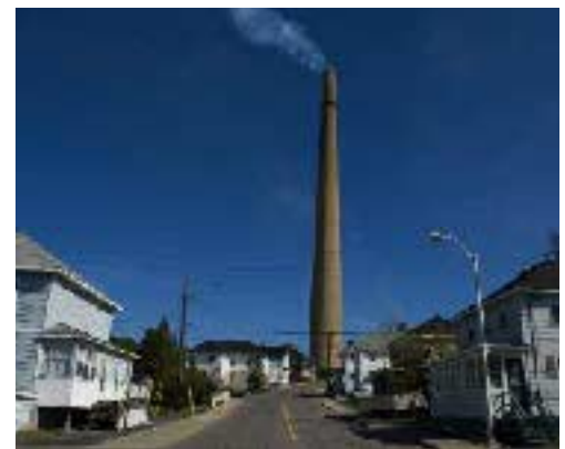
... but it is truly colossal. At 381 meters in height, it is the second tallest stack in the world.

Although environmental protection was not a mainstream concept as it is today, the world's largest nickel smelter constructed its Superstack in 1972 to address environmental performance. At 381 meters it is the tallest chimney in the western hemisphere, and the second tallest in the world. It dwarfs the Eiffel Tower and most New York skyscrapers. The intention was to take the sulfur oxide so