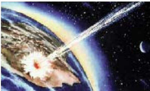
The Sudbury basin was formed about two billion years ago.

The story of the mining in the region starts a long way back – around two billion years in fact, to a time when a huge meteorite struck the planet and created the geological region known as the Sudbury basin. The massive impact from the meteorite melted the