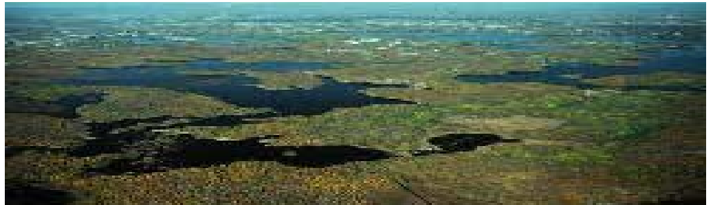
Sudbury lies at the centre of more than a million lakes in the Boreal Shield Ecozone.