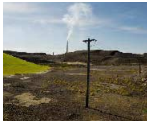
From far away, the Superstack does not seem particularly huge ...

There are not many places on Earth where such complete environmental degradation could be witnessed. Already likened to a moonscape, the training of Apollo astronauts in the area in 1971, identifying rare rock formations caused by meteorite impact, seemed quite ironic at the time.