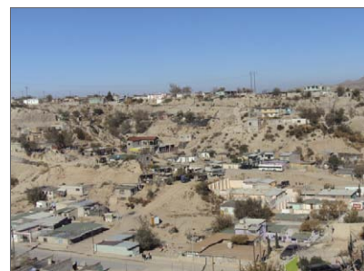
Social and spatial marginality.