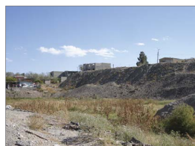
Risk due to eroded slope.