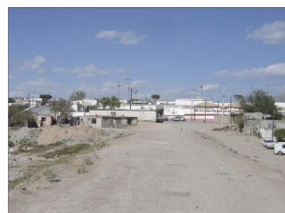
Neglected retention basin.