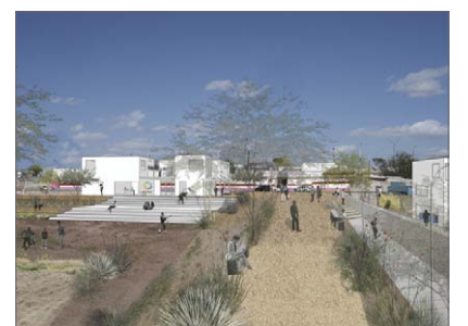
New park / local workshops.