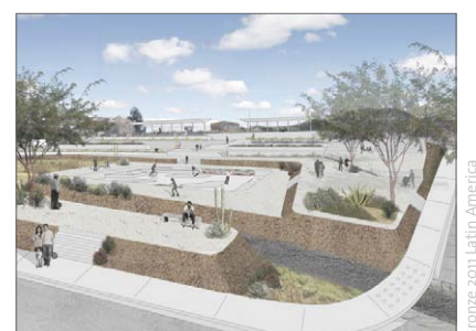
Skatepark / urban agriculture.