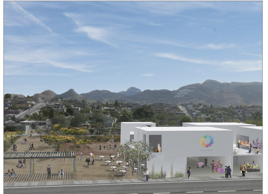
The transformed retention basin includes spaces for community workshops and local commerce, acting as a complement to an existing community center.

The improvement of the context is an imminent result of the improvement of such residual spaces as the neglected retention basins. The consolidation of sidewalks and paving of streets as well as the introduction of vegetation would lift the neighborhood not only aesthetically but also socially. The disciplines of architecture, urbanism and landscape design are tackled by the project, creating a coherent strategy that goes from the general to the particular.