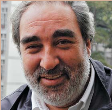
Eduardo Souto de Moura , Architect, Portugal