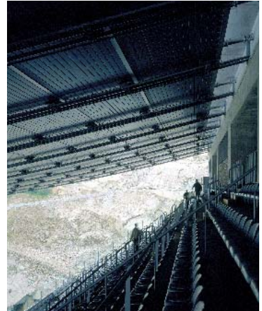
The 30,000-seat stadium is more than just the home of the local soccer team; it is the focus of a new urban park planned along the northern slopes of Monte Castro and the banks of the Cávado River. A million cubic meters of granite were blasted from the slope and crushed into aggregate to make concrete for the stadium – the structure literally evolved from its site. A series of precise blasts created the 30-meter-high granite face that terminates the southeast end of the stadium. Only meters from the stadium, this rock wall creates a dramatic juxtaposition of the natural and the man-made.

I think nature was born to be manipulated, but the manipulation should not be indiscriminate. Nature can be altered in the service of man and community, but there are limits. I'm not against dams for producing electricity. It's part of progress. Changing the course of a river, temporarily interrupting the flow and restoring it later is one thing, but it is quite another thing to relocate a river and thereby change the microclimate, the topography, the local environment. That's what I'm against. A professor of mine used to warn us: "Watch out what you do to nature, otherwise it will take revenge." And it really does.