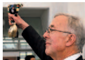
Signal to end a break in classic Swiss style.

The will of the people to change things – and at the same time their friendliness. For someone from Switzerland, where the wheels usually turn at slower pace, it is fascinating to see here how much movement can be achieved. In record time, skyscrapers are raised, bridges built, plans realized. That is, in spite of the downside that such development of course can have, simply fascinating.