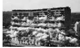
Identity destroyed at the push of a button: tabula rasa in the banlieues.

French architect Jean-Philippe Vassal speaks deliberately, with long pauses between statements, describing the work of Lacaton & Vassal using words like “graceful,” “delicate,” and “generous.” What does this mean in terms of architecture and the city?