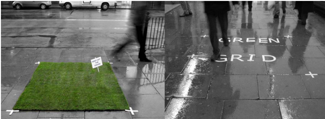
Figure 2: ‘Propagating Green Corridors’. Interruptions: Making the Green Grid Public (Richa Mukhia, AADip 14, 2005/2006)

To do so, it is important to recognise the public as experts of their own territory (that they inhabit) and to integrate them into the planning process right from the outset. Through a series of guerrilla interventions, including patches of turf on the pavement or street markings on grass pitches, the issue of the Green Grid was directly made public, and created a platform of discussion not in a distant community hall, but right on the sites on which the scheme would be implemented [Fig 2]. Unlike common maps and drawings of urban proposals, this strategy of representation avoids the desocialisation of the territory affected. 43 The information, opinions and concerns were publicly documented in brochures, presentations and on a website.