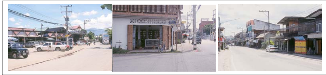
Figure 1: Dimension 1—Vast Concrete Areas (Average Preference Score = 2.53)

The analysis yielded 7 dimensions. Each dimension shows a group of scenes depicting common characteristics of the environments according to perceptions of foreign tourists. Six out of seven show high potential to enhance the authenticity and the atmosphere of the communities and are described as follows: 36