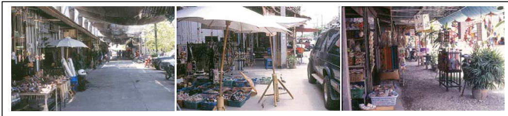
Figure 4: Dimension 4—Souvenir Shopping Path (Average Preference Score = 3.24)

Dimension 3 is called Natural Village Alleys due to its common characteristic of narrow and curved alleys with trees and other vegetation in vernacular environments. The respondents described this dimension as calm, relaxing, local and natural, which are attractive and positive. The tourists also prefer this dimension.