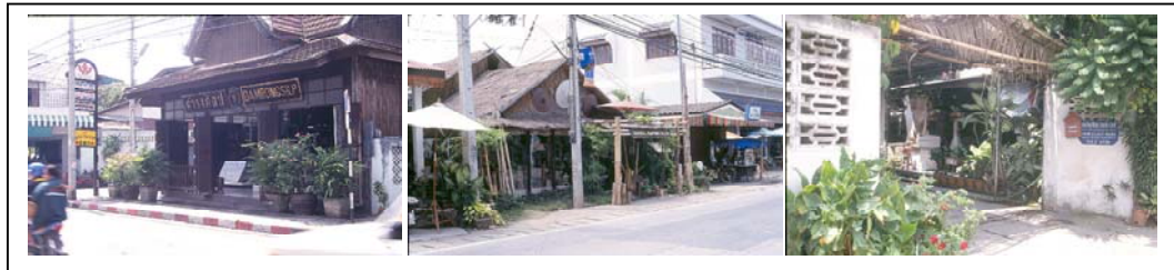
Figure 6: Dimension 6—Old Style Vernacular Houses (Average Preference Score = 3.15)

Dimension 5 is named Original Canal Areas due to its common characteristic of common areas on a small irrigation canal between lines of small vernacular style shops with some vegetation, which is an original area in Baan Tawai community. The respondents described this dimension as peaceful and shady gardens and commercial areas, which are beautiful and interesting. The tourists prefer this dimension the most.