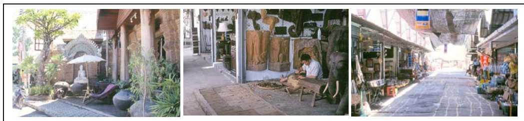
Figure 1: Baan Tawai Community

Baan Tawai, Borsang and Wualai are the most famous art and craft production communities for woodcarving, paper umbrella and silverware respectively. Their histories include the vernacular characteristics of production communities. While these communities are flourishing in tourism, they are experiencing unplanned growth and the loss of original characteristics of specialized production communities. This renders the communities unidentifiable, less attractive and trapped in low cost competition among mass product outlets in mundane places.