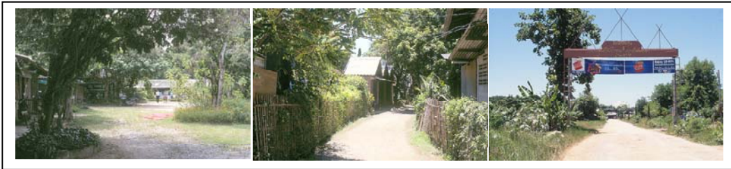
Figure 3: Dimension 3—Natural Village Alleys (Average Preference Score = 3.19)

Dimension 2 is named Production Areas and Activities due to its common characteristic of people doing handcraft activities in vernacular environments. The verbal descriptions from the respondents for this dimension were articulated as interesting and attractive. The tourists moderately prefer this dimension.