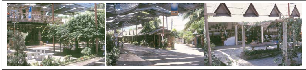
Figure 5: Dimension 5—Original Canal Areas (Average Preference Score = 3.33)

Dimension 5 is named Original Canal Areas due to its common characteristic of common areas on a small irrigation canal between lines of small vernacular style shops with some vegetation, which is an original area in Baan Tawai community. The respondents described this dimension as peaceful and shady gardens and commercial areas, which are beautiful and interesting. The tourists prefer this dimension the most.