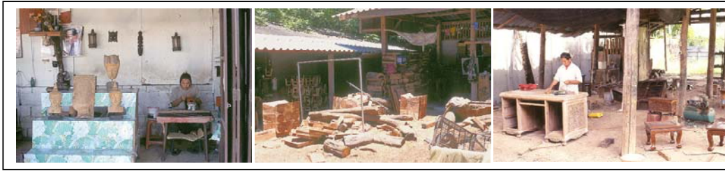
Figure 2: Dimension 2—Production Areas and Activities (Average Preference Score = 3.15)

tourists as boring and empty, with wide streets or commercial areas which are unpleasant and unlikable. This dimension is the least preferred dimension by the tourists.