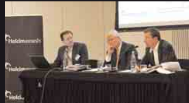
At a media briefing, the Holcim Foundation, the Awards competition and the prize winning projects were presented in detail.