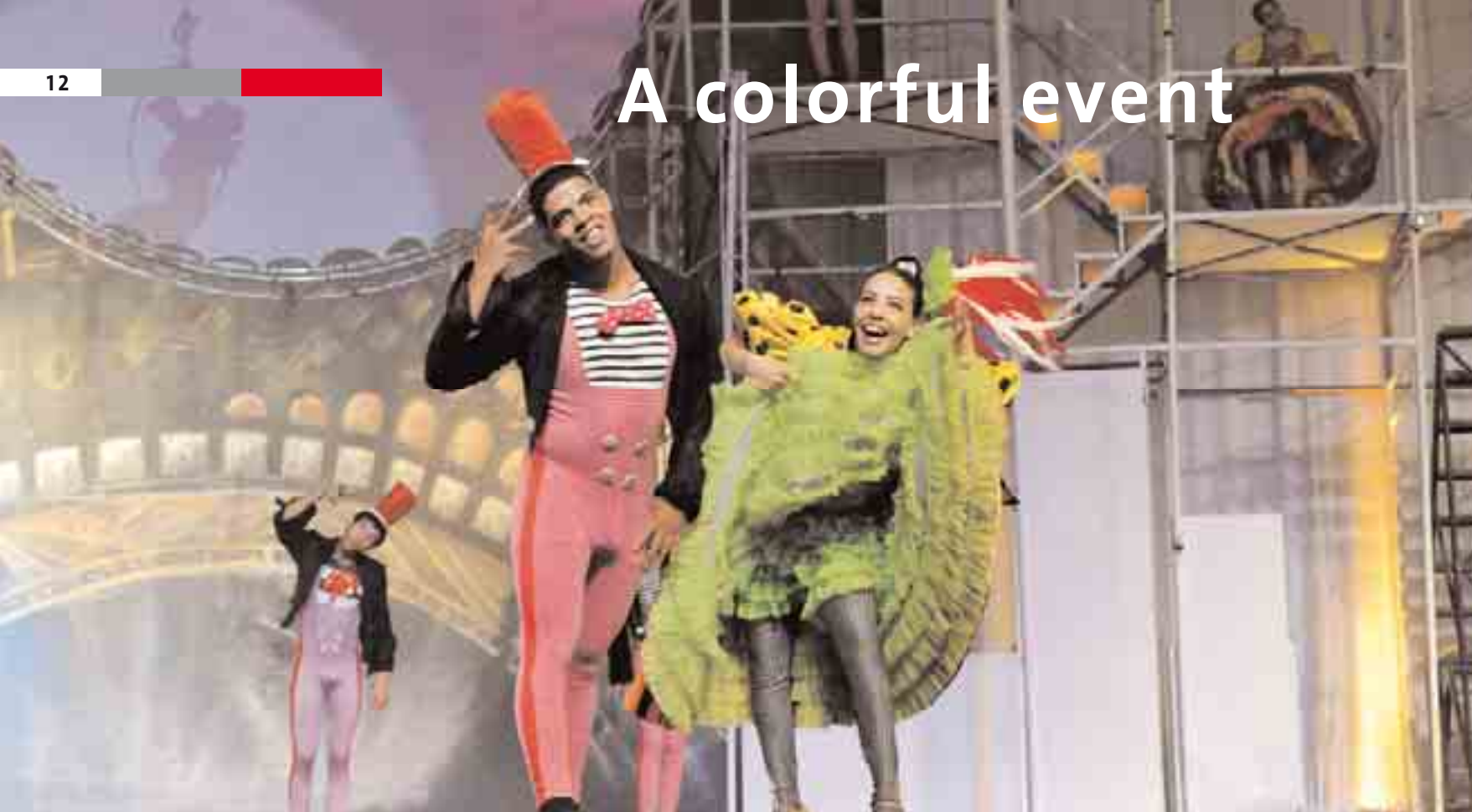
The ceremony concluded with a banquet and breathtaking show in the dinner theater "Les Folie's de Marrakech".