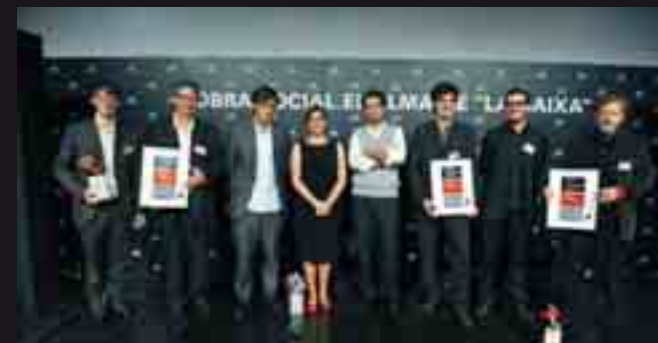
Winners of the Holcim Awards for the region Europe from Switzerland, Spain and Hungary (from left to right).