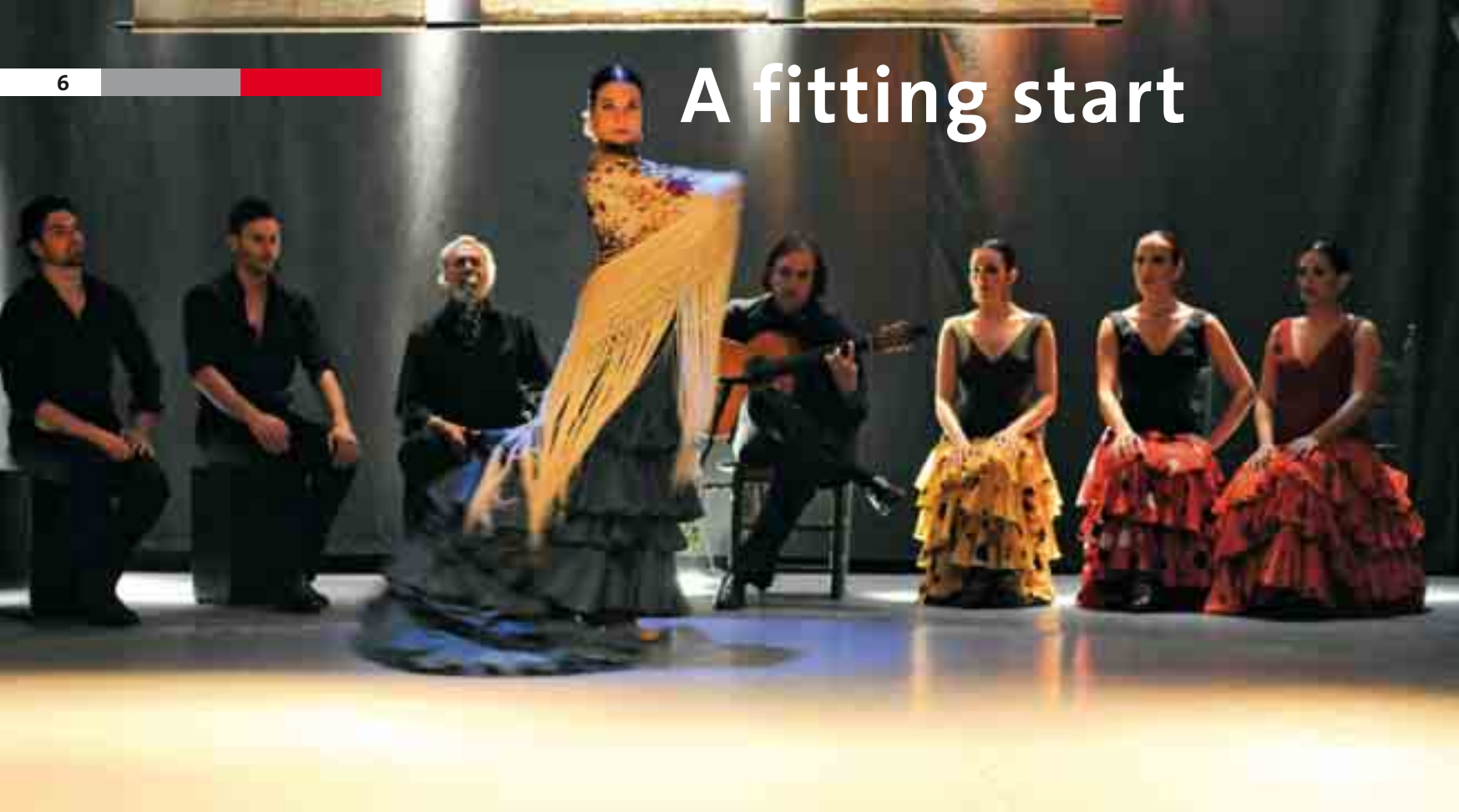
Flamenco dancers created a dramatic mood and local flavor to conclude the event in Madrid.