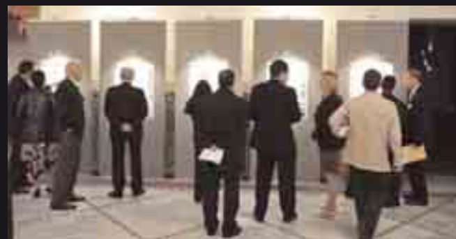
The exhibition after the Awards ceremony gave all guests and winners the possibility to delve further into all prize-winning projects.