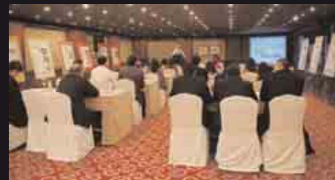
At the media briefing the main prize winning projects were exhibited and presented by the authors in more detail.