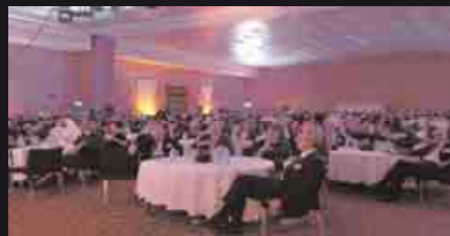
The venue at the Palmeraie International Conference Center, full to the brim with attentive guests.