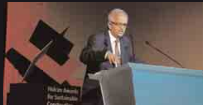
Economist Bimal Jalan, Member of the Indian Parliament and former governor of the Reserve Bank of India illustrated in his speech the vast opportunities for sustainable construction to make a tangible difference in both developing and developed countries.