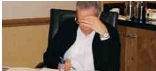
The steps of judging: studying...