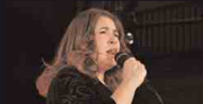
The internationally renowned singer Tania Libertad transformed the dinner following the ceremony into an emotional celebration.