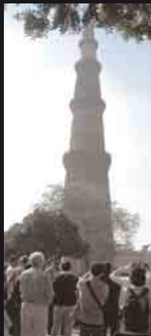
The “sustainable construction tour” included future-oriented modern buildings and ancient architecture that has stood the test of time: a visit to Qutub Minar, the tallest brick minaret in the world.

On the evening of the ceremony in New Delhi the thoughts of many guests were with the victims of the brutal attacks in Mumbai the night before. The Awards presentation in the “India Habitat Centre” and the supporting program were kept modest yet offered the 320 guests from 23 countries an unforgettable experience while forming a worthy conclusion to the series of regional Awards ceremonies.