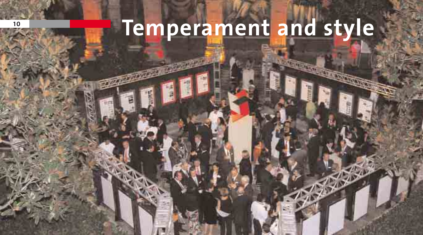
Open-air exhibit: presentation of the prize-winning projects in the courtyard of the 16 th century building.