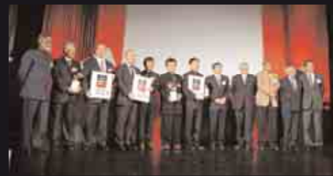
The winners of Holcim Awards Gold, Silver, and Bronze with Holcim representatives, diplomats, and jury members.