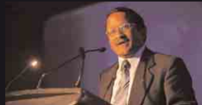
Mayor of Saint-Laurent, Alan DeSousa, welcomed the guests.