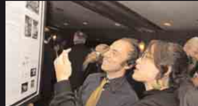
After the prizes were bestowed, the winning projects were presented in an exhibition; the winners answered questions and talked with the guests.