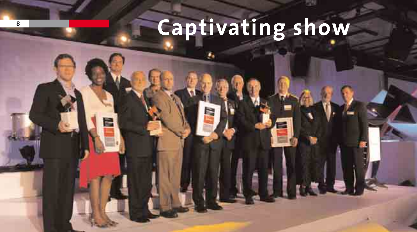
The winners of Holcim Awards for the region North America – along with jury members, diplomats, and Holcim representatives.