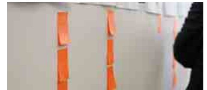
... and ranking!