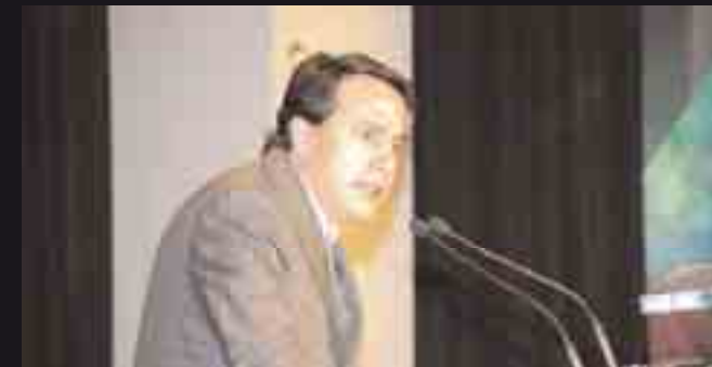
Gerardo Ruíz Mateos, Secretary of Economy of the Republic of Mexico, delivered an address that emphasized the broad potential for sustainable construction to generate tangible change, both social and environmental.