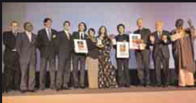
All winners of regional Holcim Awards, accompanied by diplomats, jury members, and Holcim representatives.