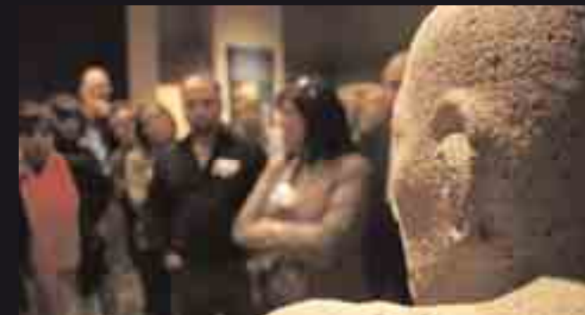
Participants of the excursions on the second day met for a special guided tour in the famous Museo Nacional de Antropología de México.