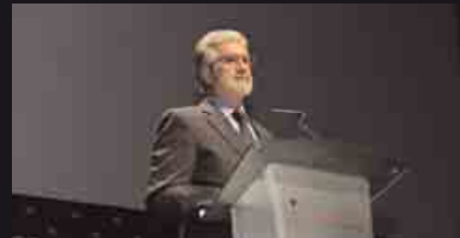
Manuel Marín González, former President of the Spanish Congress of Deputies and long-time member of the European Commission, delivered a speech emphasizing the importance of sustainable construction in Europe.