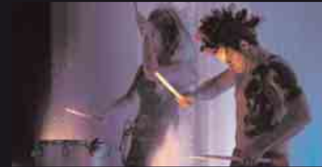
The entertainment group "Insolita" provided the audience lively breaks during the ceremony.