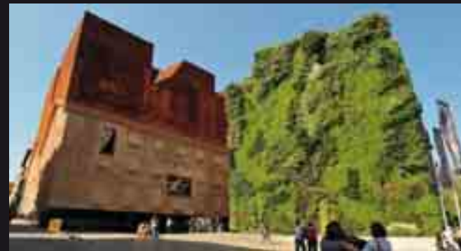
Ideal venue: the former Central Eléctrica del Mediodía power station transformed into Caixa Forum by the Swiss architects Herzog & de Meuron.